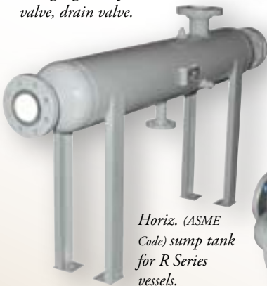
Horiz. (ASME Code) sump tank for R Series vessels.