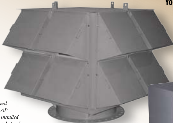
Four face 16 panel filter housing with raised bottom flanged exit connection.