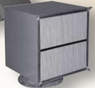
Single face S10-0001 panel filter w/o weather hood.