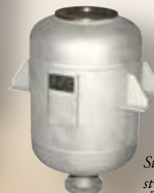
Stainless steel bladder style accumulator.