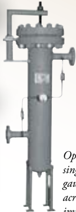
Optional single ΔP gauge installed across inlet/outlet improving accuracy.