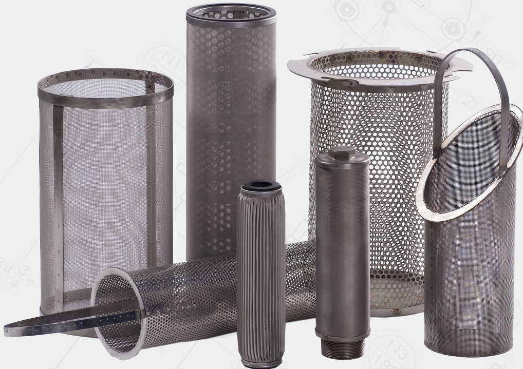
Wedge-wire type strainer

Y type, perforated metal basket, with or W/O wire mesh.